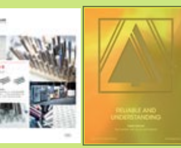
Full page Bleed 216 X 283 mm.