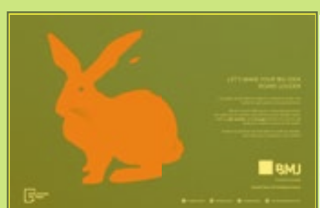
2 page Spread (full bleed) 426 x 283 mm.